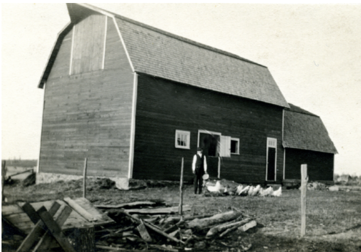
Figure 82. Barn at Quamba.