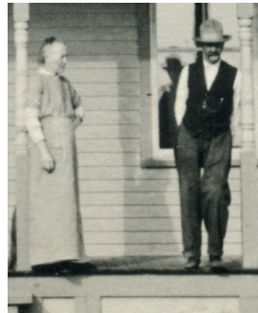
Figure 81. (Detail from Fig. 80)